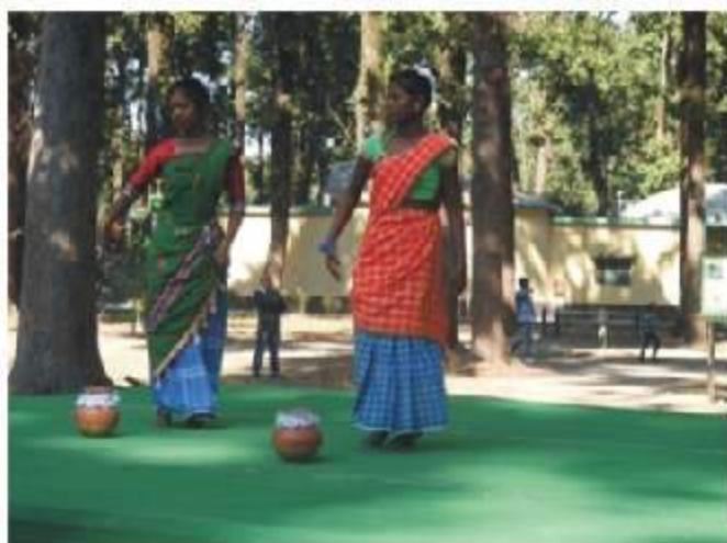
Girls Performing Adivasi Dance