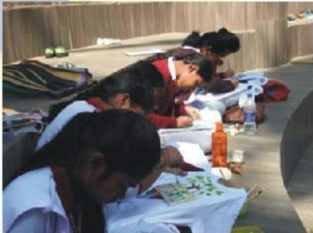
T-Shirt Painting- Girls working with their skills