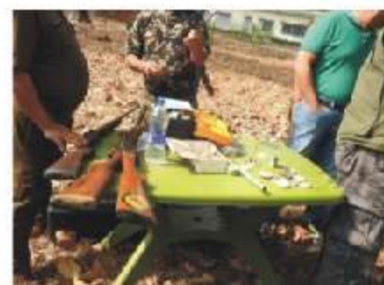
Training Session (Display of Arms)