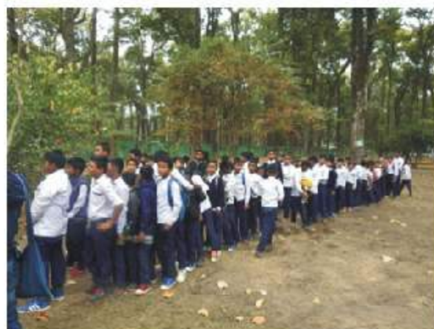
Zoo Exposure Programme of Euro Kids, Siliguri and Nand Prasad High School (H.S), Naxalbari