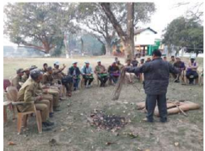
“Capacity Building of Mahouts in Assam (Field Practical Session)”