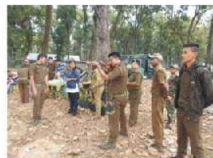
Training Session (Field Practical III)