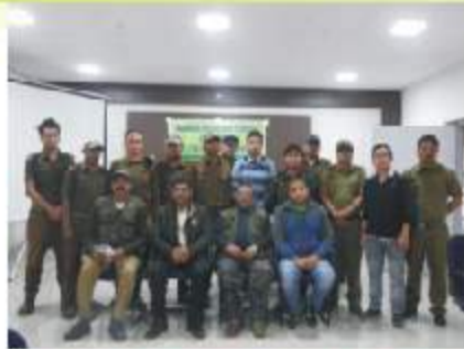
Training Session- Closing Ceremony