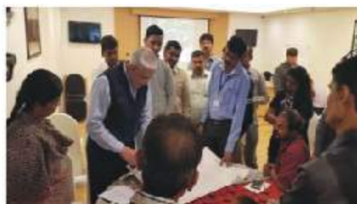
Middle Officials Training Session in New Delhi