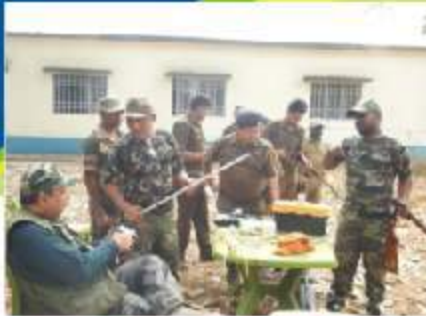
Training Session (Field Practical IV)