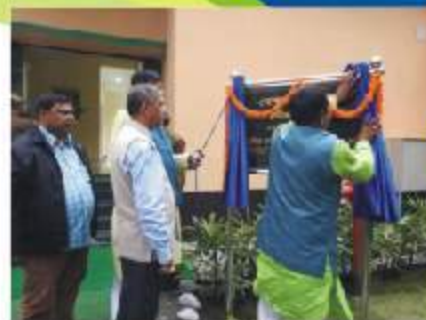
NIC Inauguration- Inauguration of NIC Building and a visit by Hon'ble Ministers, Govt. of WB