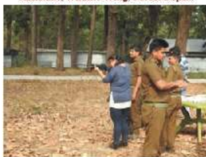
Training Session (Field Practical II)