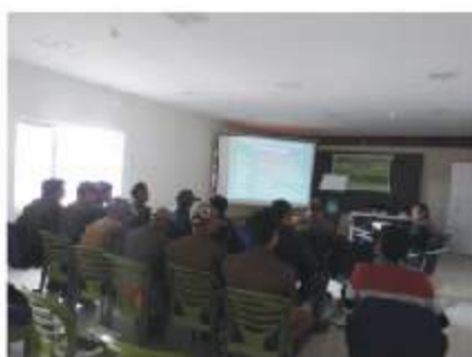
Training Session (discussion) on Chemical Restraint of Wild Animals