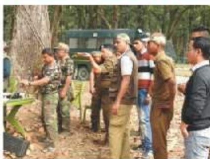
Training Session (Field Practical I)