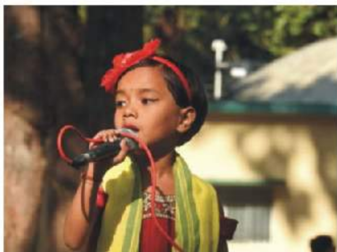
Little Girl Performing Rajbangshi Folk Song