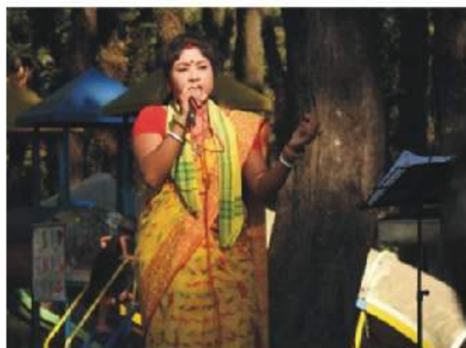
A Lady Performing Rabindra Sangeet