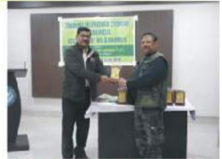
Training Session- Vote of Thanks Moments