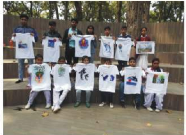
T-Shirt Painting- Hard work pays off