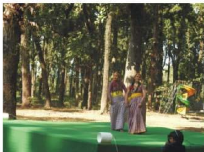
Performing Nepali Dance