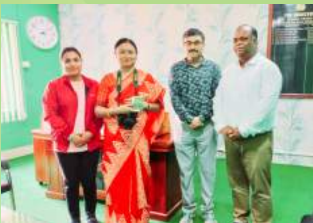
A moment with Honorable Justice Amrita Sinha, Judge, High Court, Calcutta, West Bengal during her visit to Bengal Safari.