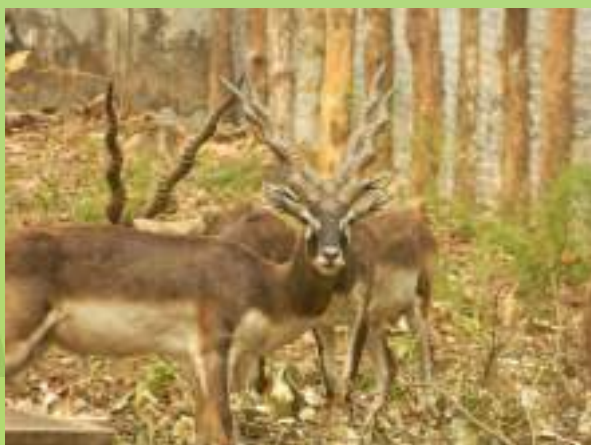
Newly acquired Black Buck from Tata Steel Zoological Park, Jamshedpur