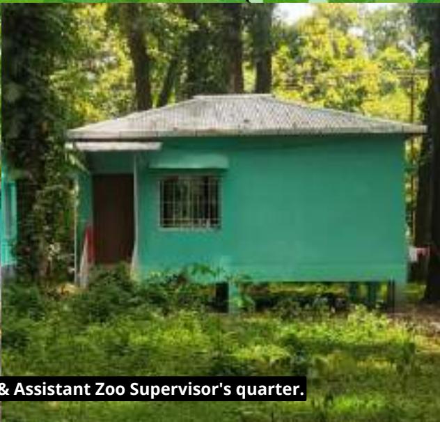
Fig: Construction of Zoo Supervisor & Assistant Zoo Supervisor's quarter.