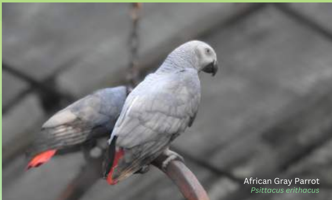
African Gray Parrot Psittacus erithacus