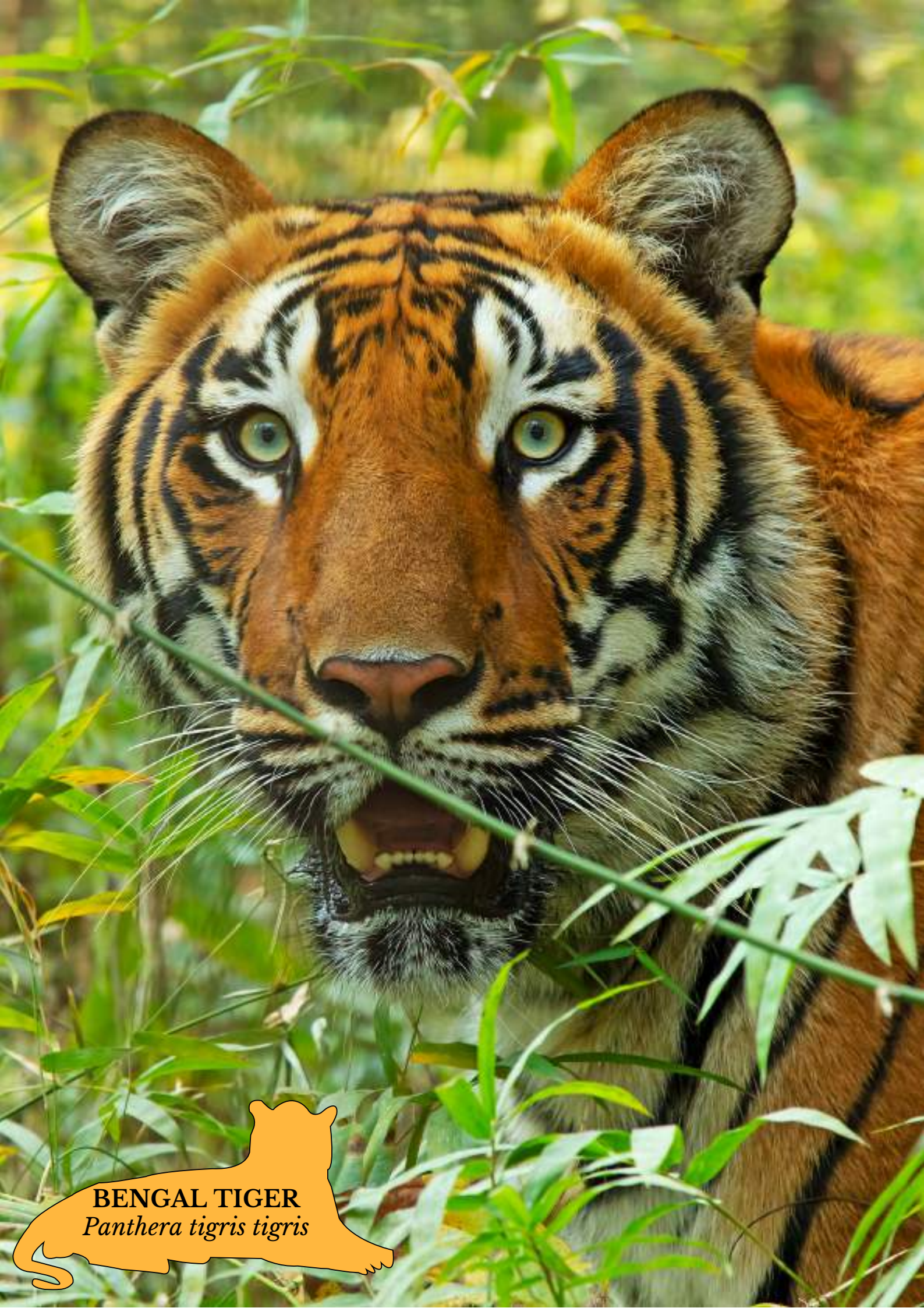
BENGAL TIGER Panthera tigris tigris