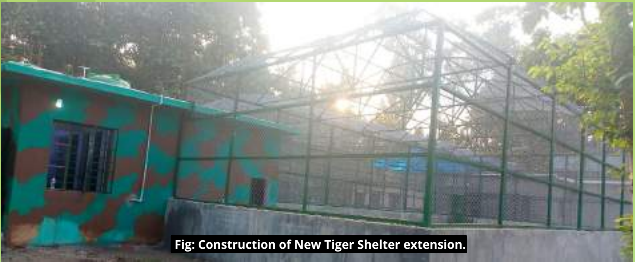
Fig: Construction of New Tiger Shelter extension.