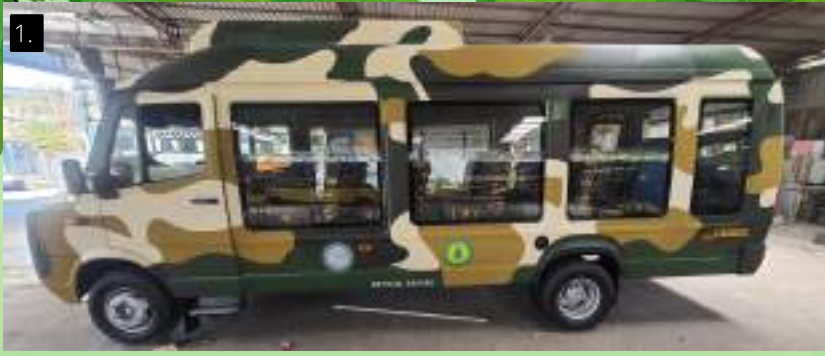
Fig: Collage of Miscellaneous repair & Maintenance works