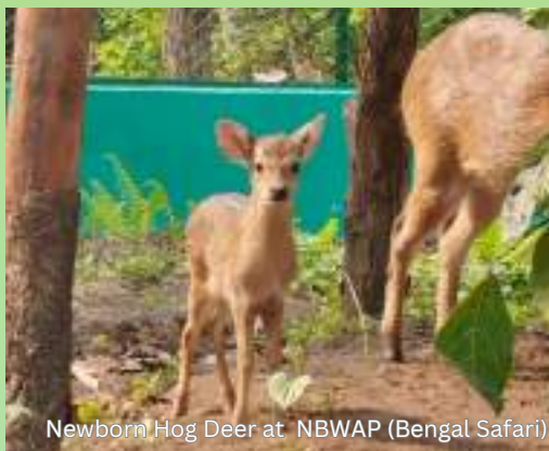
Newborn Hog Deer at NBWAP (Bengal Safari)