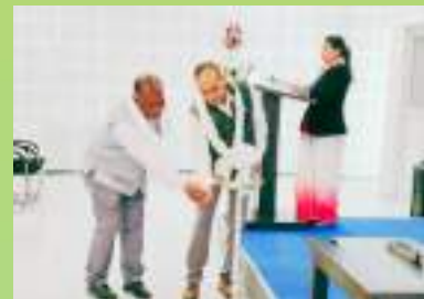
Diya lighting (Pradeep Prajjwalan) in Foundation Day