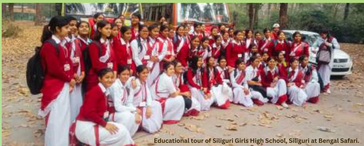
Educational tour of Siliguri Girls High School, Siliguri at Bengal Safari.