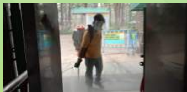
Fig: Disinfection, fumigation, sanitization works carried out by staffs of Bengal Safari