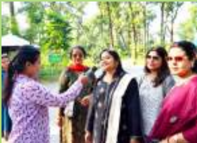
Visitors sharing their knowledge regarding wildlife conservation

Bengal Safari Celebrated World Wildlife Conservation Day through an interactive session with the visitors and sharing knowledge regarding the conservation of wild animals. Red Cross Society Kalimpong donated winter essentials such as blowers, blankets, heaters, etc for use in animal shelters.