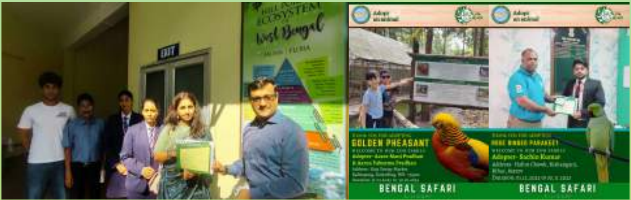
Two numbers of Kangaroo adopted by St. Michael's School for Girls. Adoption Certificate awarded by Member Secretary, WBZA, Kolkata.