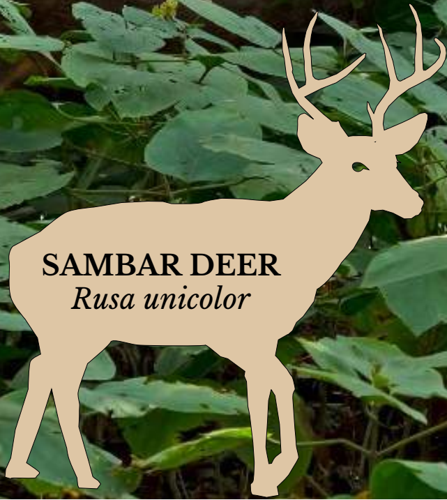
SAMBAR DEER Rusa unicolor