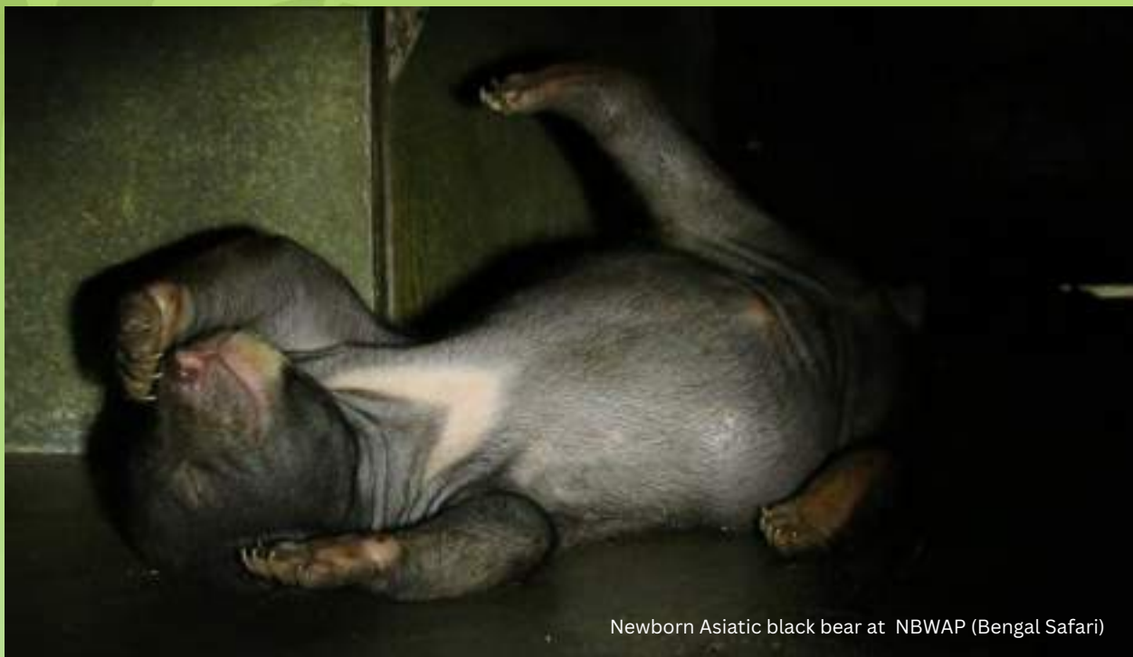
Newborn Asiatic black bear at NBWAP (Bengal Safari)

The Park is not involved in any Conservation breeding programmes yet. Still, natural breeding has occurred in the Bengal tiger, Asiatic Black Bear, herbivores (Spotted Deer, & Hog Deer), and pheasants.