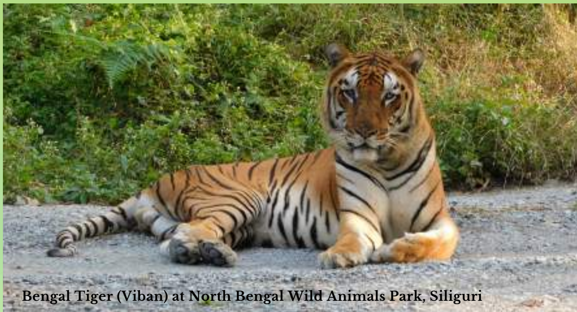
Bengal Tiger (Viban) at North Bengal Wild Animals Park, Siliguri