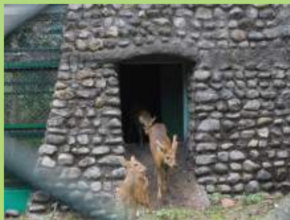
Newly acquired Hog Deer from Tata Steel Zoological Park, Jamshedpur