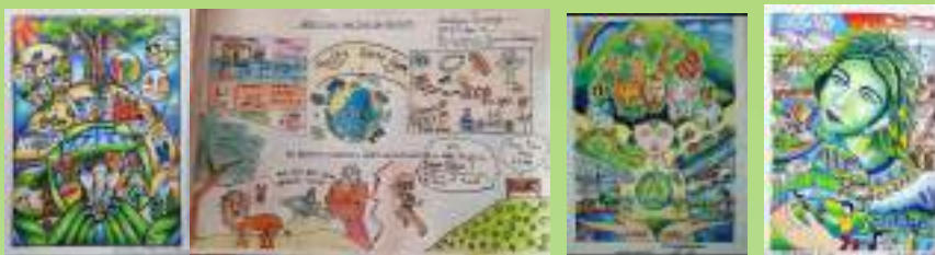
Few works of online art competition on Wildlife Week

An educational tour was organized for the students of Bethan School, Kalimpong on the last day of Wildlife Week to promote awareness and expose the children to the world of amazing animals and birds. A total of 60 nos. of students along with 7 teachers attended the tour. NBWAP organized a small interactive session with the students at the auditorium of the NIC Building, which was presented by the Research Scholars of NBWAP.