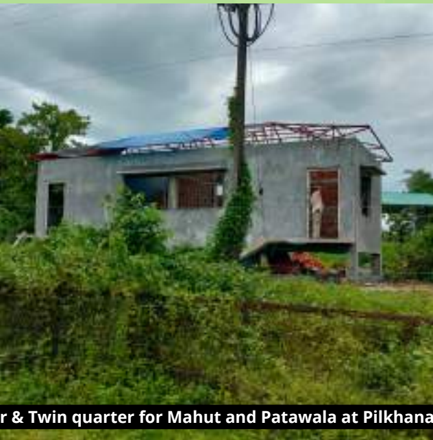
Fig: Construction of Security room at animal encloser & Twin quarter for Mahut and Patawala at Pilkhana.