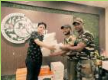
On the occasion of world wildlife conservation day, Red Cross Society donated winter essentials for the animals