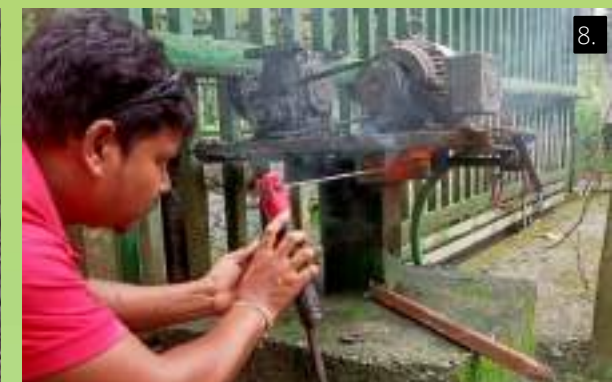
1. Remodeling of Safari bus; 2. Cleaning of Reptile pond; 3. Repainting of Administrative building, Kitchen, veterinary hospital etc. 4. Seasonal plantation at Butterfly garden. 5. Regular cleaning of ponds at herbivore area. 6. Restoration of water fountain at Tiger Safari area. 7. Repairing of Herbivore area wall; 8. Repairing of safari sliding gate.