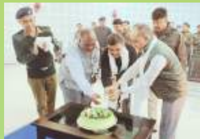
Foundation Day ceremony in presence of CCF (Wildlife North); Director NBWAP; Asst. Director NBWAP and other forest officials.