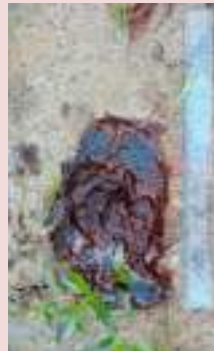
Scat of Adult Female