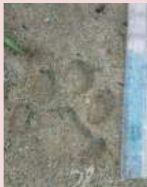
Pugmark of Adult