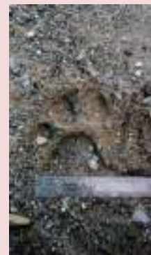
Pugmark of Female Cub