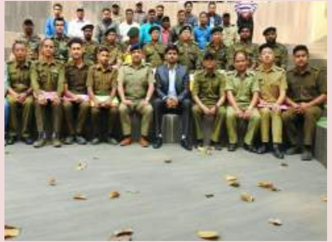
Fig: Training (refresher course) on chemical restraint of wild animals at North Bengal Wild Animals Park (Bengal Safari)