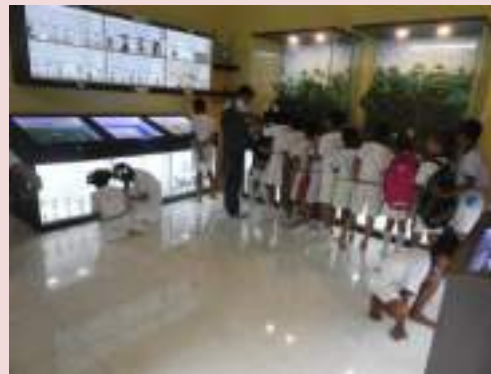
Fig: World Cleanup day celebration with Students of Kholachand Fapri Primary School