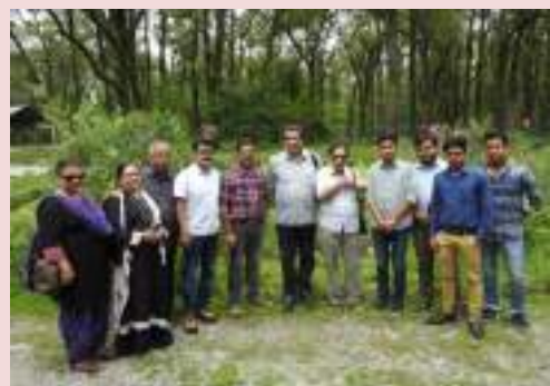
Fig: Shri Sabyasachi Chakraborty with staff of Bengal Safari

On 15 th May, 2019, a veteran actor of Indian cinema as well as a wildlife enthusiast, Shri Sabyasachi Chakraborty, along with his family had visited the park.