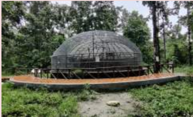
Fig: Replacement of SS Net with GI chain link at AV-3