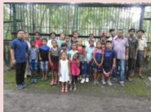
Fig: World Rhino Day celebration with Toribari Primary School