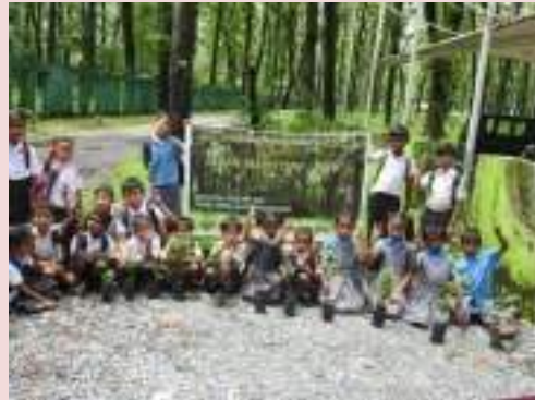
Fig: Celebration of Vanmahotsav with students at Bengal Safari