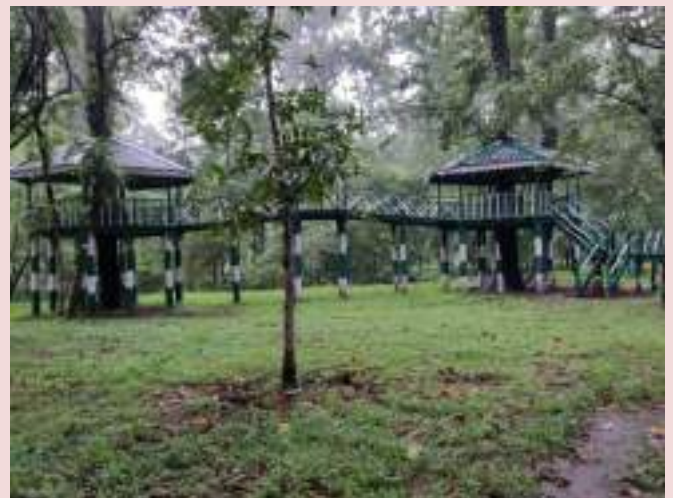
Fig: Repairing of Wooden Bridge