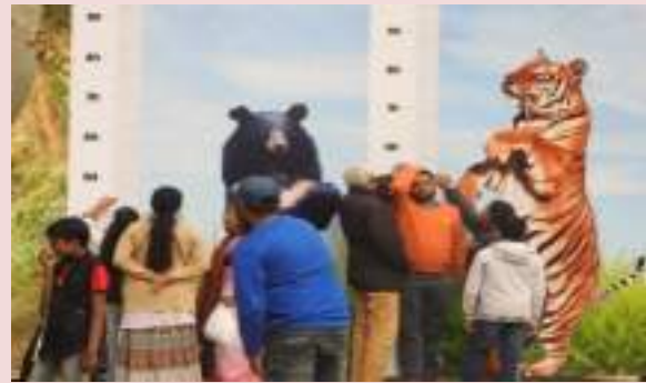
Fig: Christmas Celebration with visitors at Bengal Safari