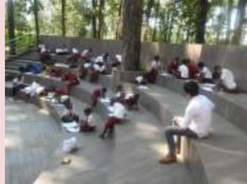
Fig: Children participating in the Sit & Draw Event on Children's Day