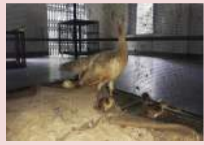
Fig: New Borns of the Safari Park