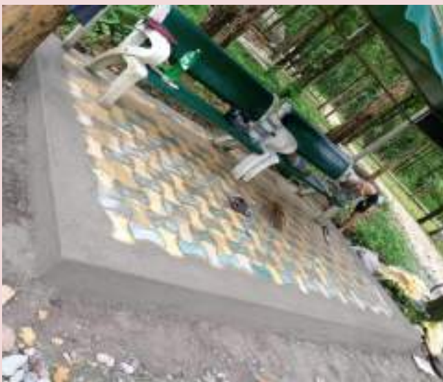
Fig: Modification at visitors seating area