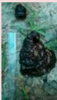
Scat of Adult Male