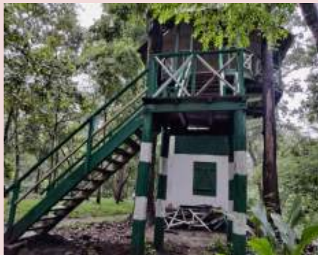
Fig: Repairing of Tree Tower