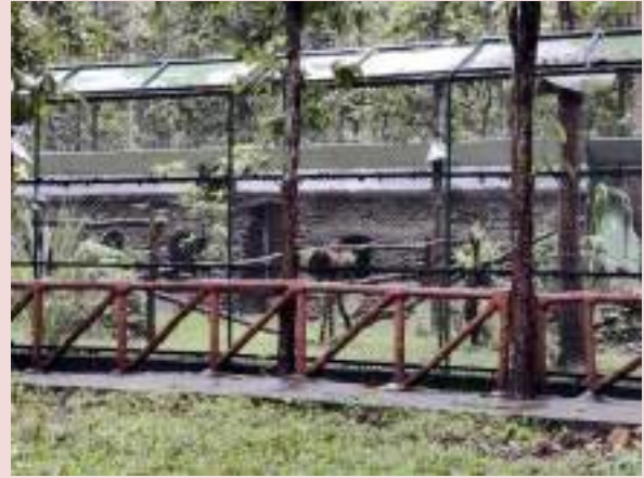
Fig: Glimpses of LC- Lesser Cat Enclosures Enrichment