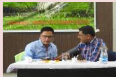
Fig:Medical Health Checkup Camp by Vedanta at Bengal Safari