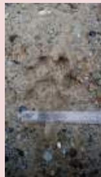
Pugmark of Female Cub