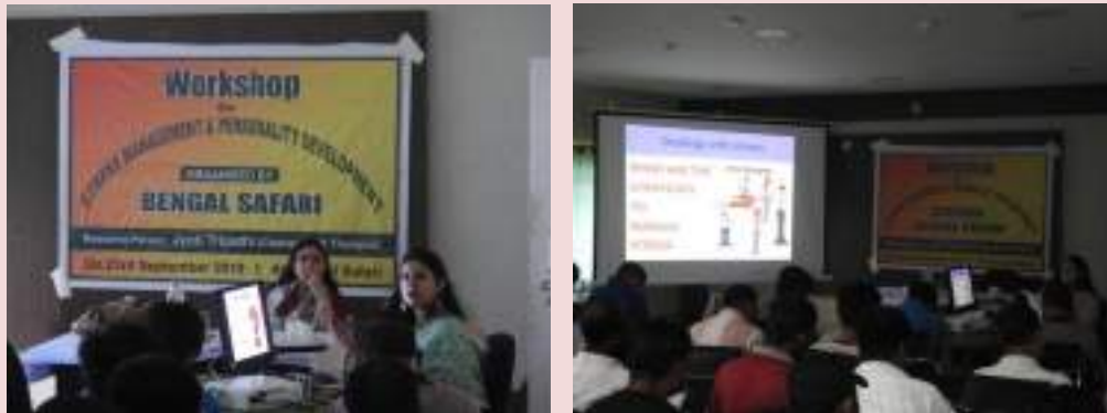
Fig: Workshop on Stress Management conducted at Bengal Safari