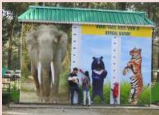
Fig: Vertical Wall Height measuring Stand