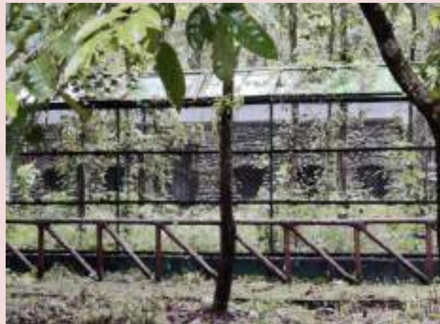
Fig: LC- Lesser Cat Enclosures Enrichment