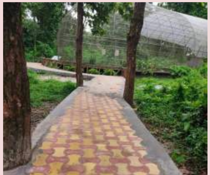
Fig: Modification of the Aviary visitors pathway