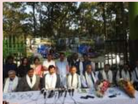
Fig: Hon'ble MIC, Deptt. of Forest & Hon'ble MIC, Deptt. of Tourism, WB innaugrating the Toytrain Ride at Bengal Safari