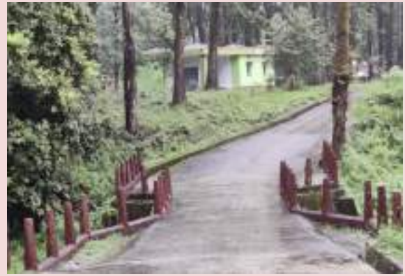
Fig: Pick up point culvert railing