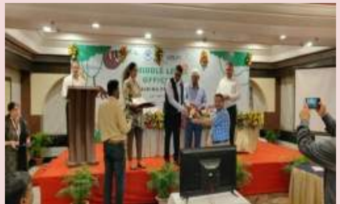
Fig: Middle Officials Training Programme, Central Zoo Authority, New Delhi