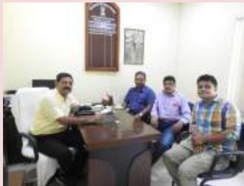
Fig: Members of the Health Advisory Committee welcomed by Bengal Safari