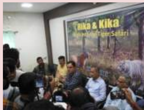
Fig: Release of Kika & Rika in tiger Safari in the presence of MIC, Dept of Forests & MIC, Dept of Tourism, W.B.