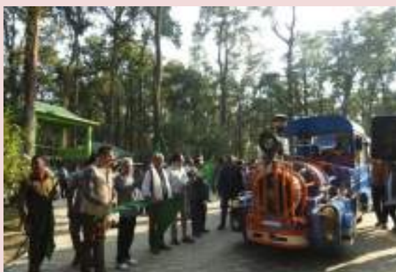
Fig: Toytrain Ride