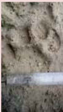
Pugmark of Adult Male

Below are few photographs from the collected samples: