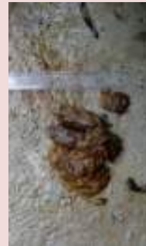
Scat of Female Cub-2