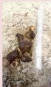
Scat of Female Cub-