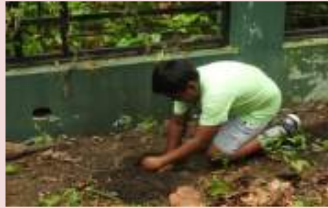
Fig: Visitors and Staff Members planting saplings during the World Environment Day Celebration.