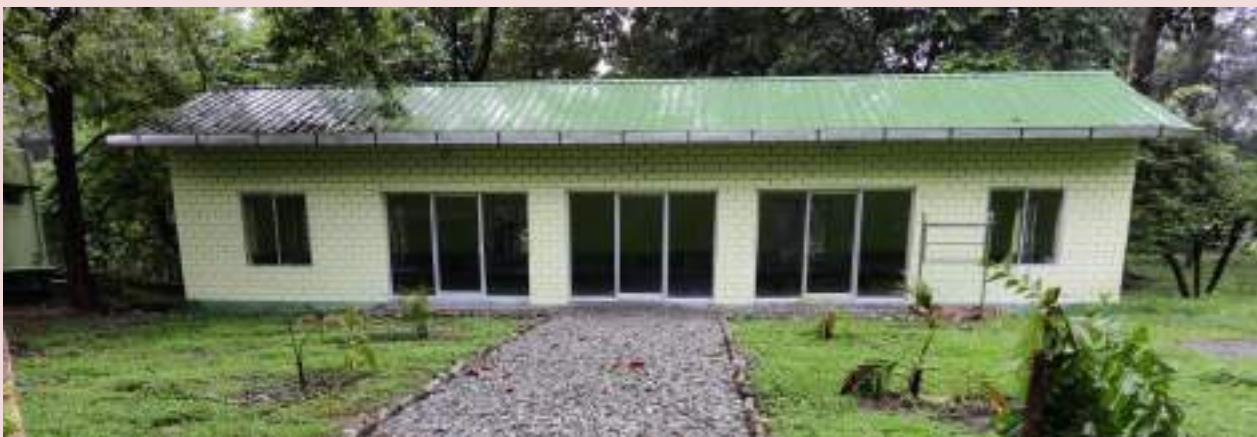
Fig: Visitors waiting room at pickup point