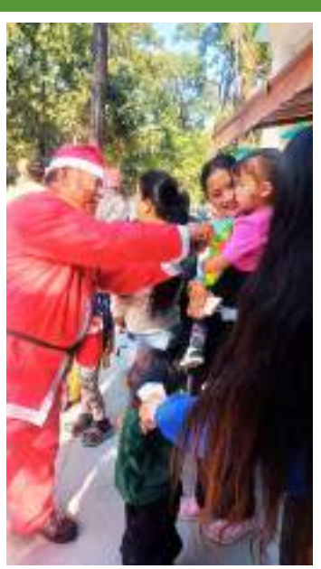
The joy on the children's faces was contagious as Santa Claus made his way through the crowd, distributing the chocolates with a wide smile.