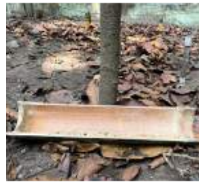
Laying out the bamboo tray and dry leaves in Aviary