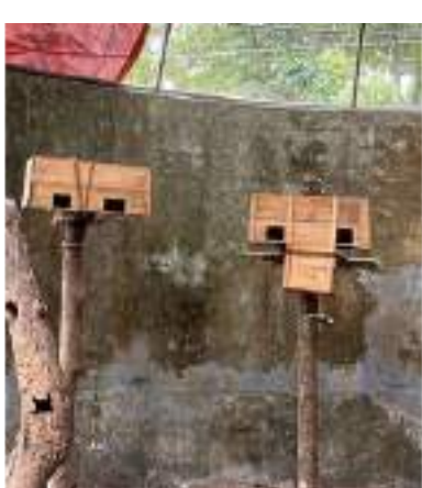
nstallation of nesting house at flying birds enclosure