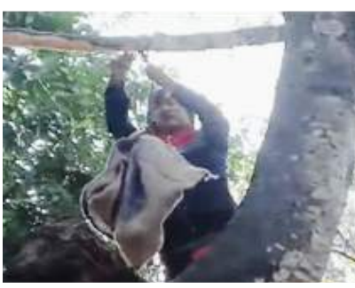
The animal attendant securely fastened sacks packed with meat using coconut rope and suspended them from a tree. To further entice the animals, chicken liver smears were applied for offactory stimulation.