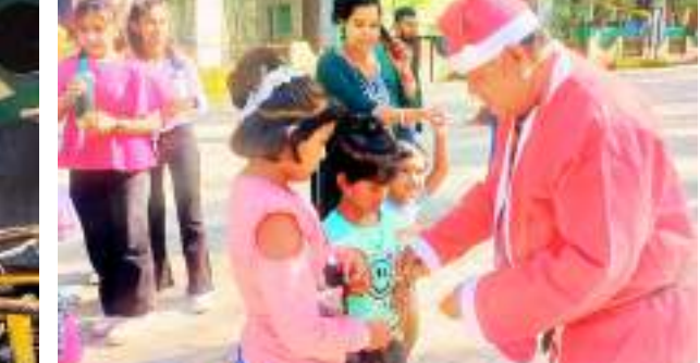
The joy on the children's faces was contagious as Santa Claus made his way through the crowd, distributing the chocolates with a wide smile.