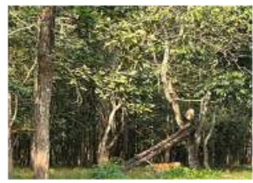
Common leopard engaged with the enrichment by sniffing and playing.