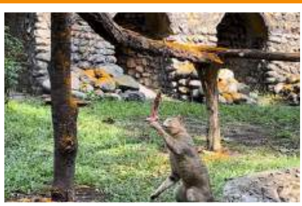
A jungle cat named Don showcasing his hunting skills with the incorporated feed enrichment