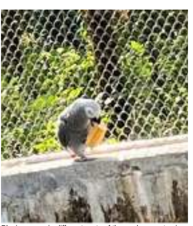
Placing corns in different parts of the enclosure at aviary