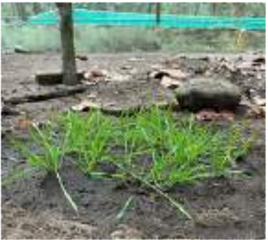
Introduction of a small patch of wheat green in the Silver pheasant enclosure-