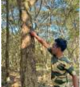
The animal attendant securely fastened sacks packed with meat using coconut rope and suspended them from a tree. To further entice the animals, chicken liver smears were applied for olfactory stimulation.