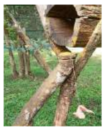
Suspended boney meat in lesser cat enclosure