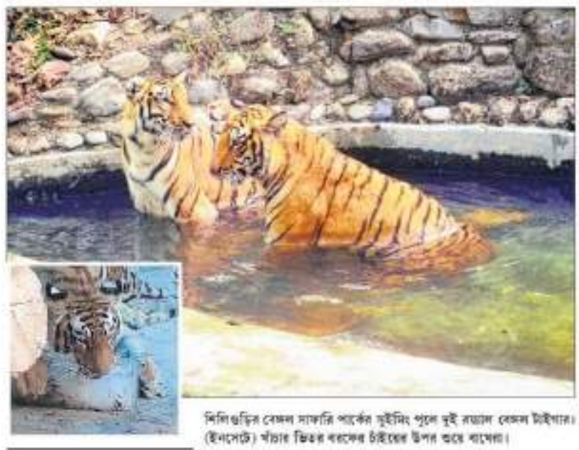
শিলিগুড়ির বেঙ্গল সফারি পার্কে দুইদিন পুকে দুই সন্ধ্যায় বেঙ্গল টাইগার। (ইনসেটে) খিটার ভিতর বরফের চাঁইয়ের উপর শুয়ে থাকে।