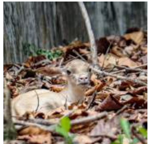
Newborn Black Buck fawn at Bengal Safari