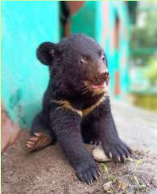
On 27.06.23, the Asiatic Black Bear cub at Bengal Safari turned three months old.