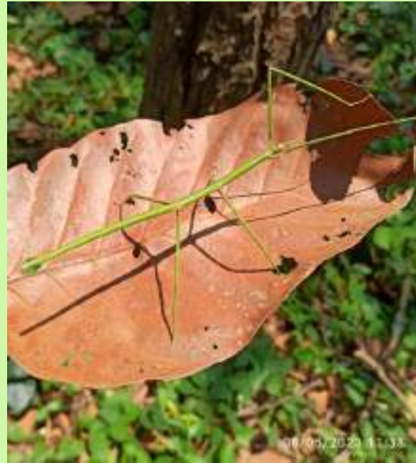
A Stick Insect resting on a dry Sal leaf at Bengal Safari