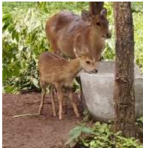
Newborn Hog Deer fawn at Bengal Safari

A Hog deer and a Black Buck fawn have been born and are already flourishing in our natural habitat. Witnessing the growth and development of these creatures is a true testament to the importance of preserving our ecosystem. We take great pride in providing a safe and free environment for these animals to thrive and we look forward to continuing to do so.