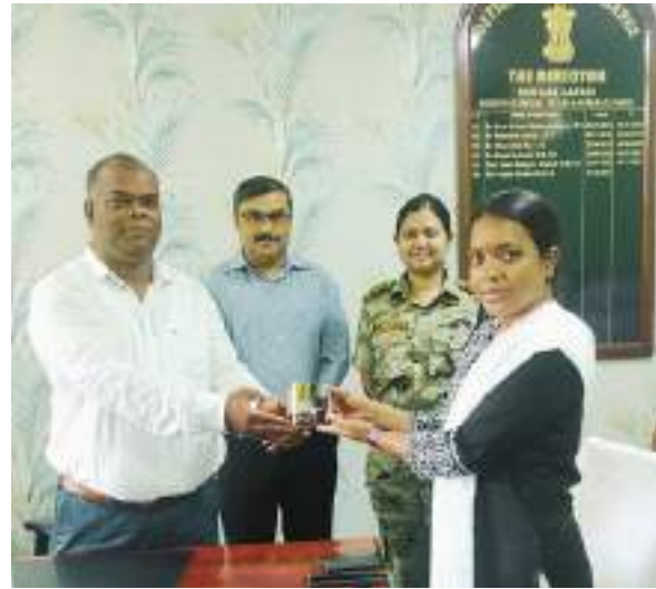
The Honourable Minister of State Receiving a Souvenir from the Director, NBWAP.

During the visit, the Honourable Minister was impressed by the park's design and layout. The animal enclosures were spacious and well-designed, providing a natural and comfortable habitat for the animals. The park's layout allowed visitors to observe the animals without disturbing them, which was also appreciated. The Minister commended the park staff for their excellent maintenance and expressed gratitude for their care of the animals.