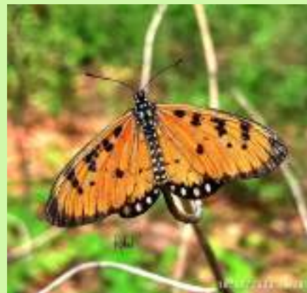
A resting Towny Coster