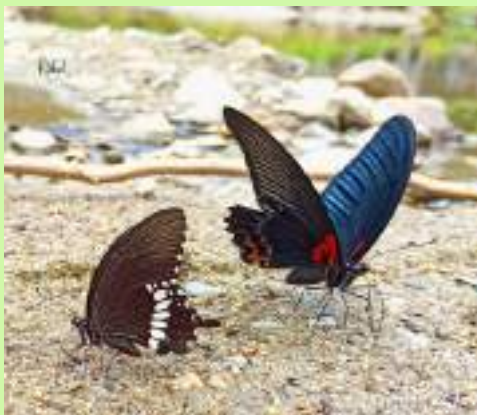
The Aesthetic Appeal of Mud Puddling in Common Mormon and Spangle Butterfly Species.