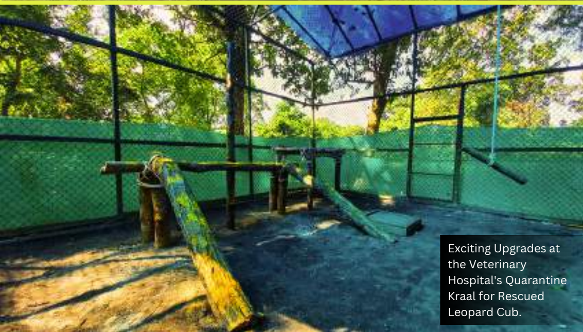
Exciting Upgrades at the Veterinary Hospital's Quarantine Kraal for Rescued Leopard Cub.