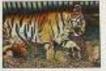
With the birth of three cubs, 'Bengal Safari: North Bengal Wild Animal Park' is now home to 13 tigers