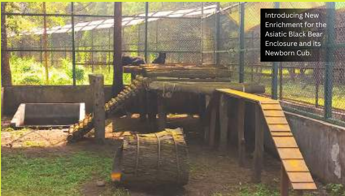
Introducing New Enrichment for the Asiatic Black Bear Enclosure and its Newborn Cub.