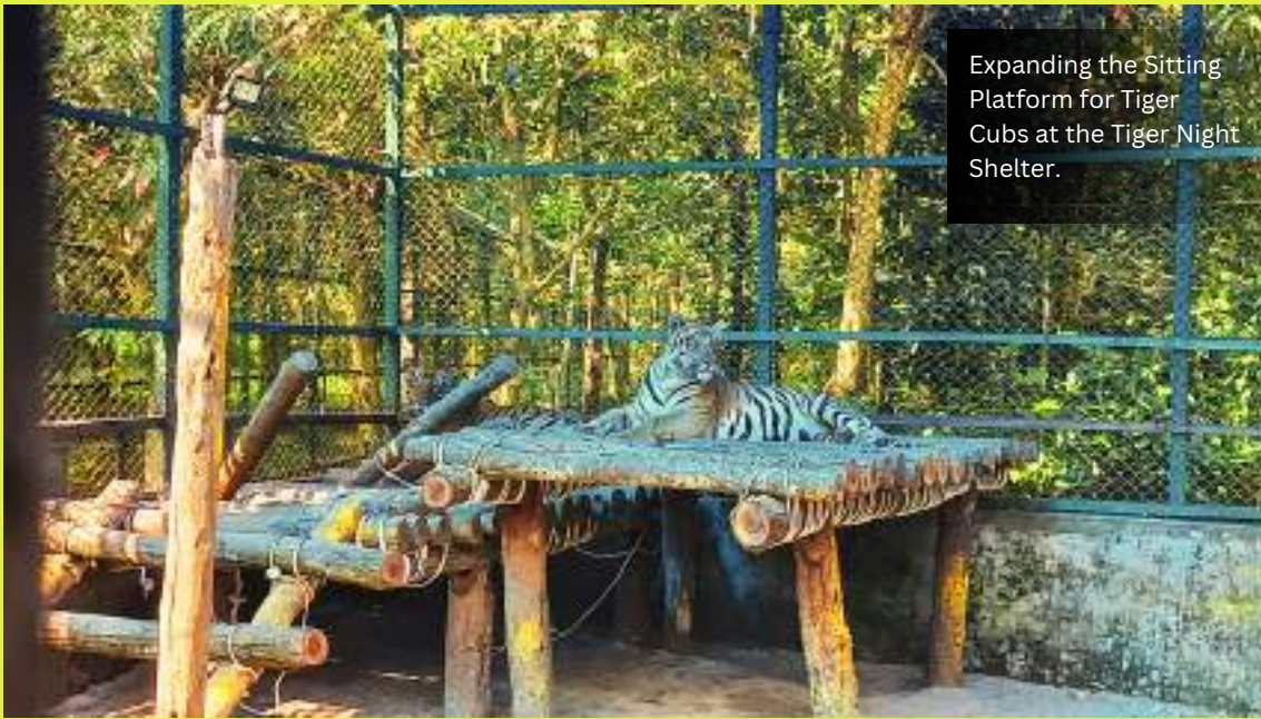
Expanding the Sitting Platform for Tiger Cubs at the Tiger Night Shelter.